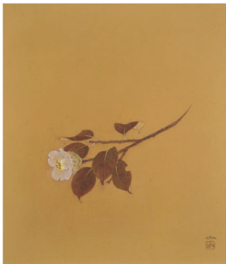
Ohno Hidetaka 大野假嵩 <White Flower 白山茶花>

开幕：2013年6月1日星期六下午四点至六点 展览持续至2013年7月2日 地址：四川中路33号703，近广东路 联系：明明 13801743061